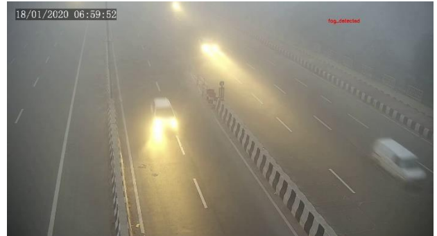
Fog/Low Visibility Detection