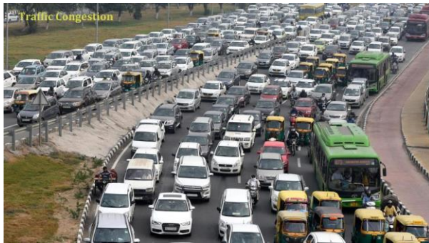
Traffic Flow Detection: Congestion