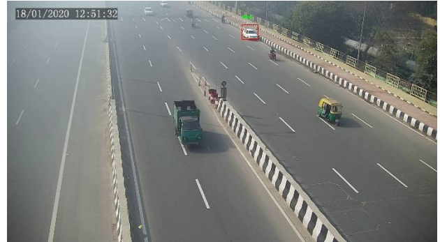
Stop Vehicle Detection